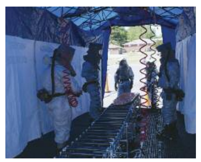
Community Emergency Preparedness Drill

Results: The one-day event was a huge success, with 84 participants undergoing arterial and/or venous evaluations. Each participant met with the Interventional Radiologists to discuss their results and follow-up, if needed. In addition, result letters were sent to the participants' primary care physicians.