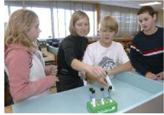
Learning about nutrition

Objective: Thompson Health and the Canandaigua City School District have formed a group known as Partners for Wellness which focuses on wellness initiatives between the organizations. Thompson has provided classes at two of the school district wellness days which included topics such as stress management, yoga, physical therapy, etc. As a result of this partnership, we imple-