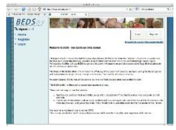
Bed Exchange Data System (BEDS).

The Financial Aid/Community Care program is evaluated annually by the Director of Patient Financial Services.