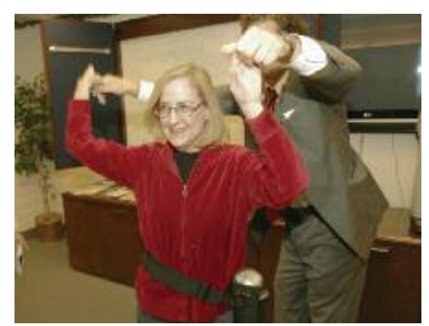
The Better Breathers Club brings joy

Thompson Health offered 12 support groups in 2007 for the following health topics: Bereavement, Breast Cancer, Smoking Cessation, Dementia (2 groups), Diabetes, First Time Around (new moms), Finger Lakes Fibro Friends (fibromyalgia), Healing Pathways (chronic stress), Infant Loss, Man-to-Man (prostate cancer) and Thompson Better Breathers Club (lung disease and breathing disorders).