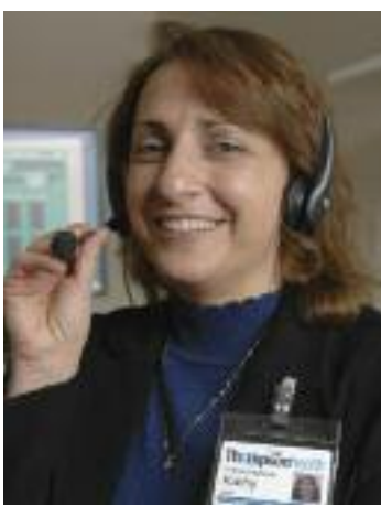
A caring voice with the answers

community a way to contact the hospital about their pricing questions and needs through a dedicated program that is easy to access. This allows patients to focus on healing and getting better, rather than on uncertainty surrounding the expense.